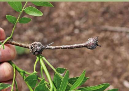
Although this growth may appear to be a gall, it's actually a reaction to exposure to a herbicide.