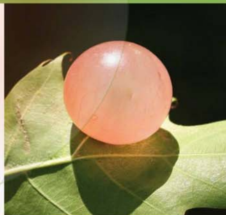
Translucent oak gall