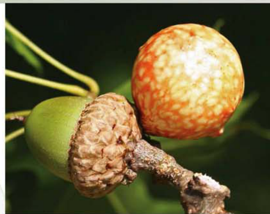
Acorn plum gall

They arise from veins on the underside of leaves, and their size and weight cause affected leaves to droop making the galling more noticeable.