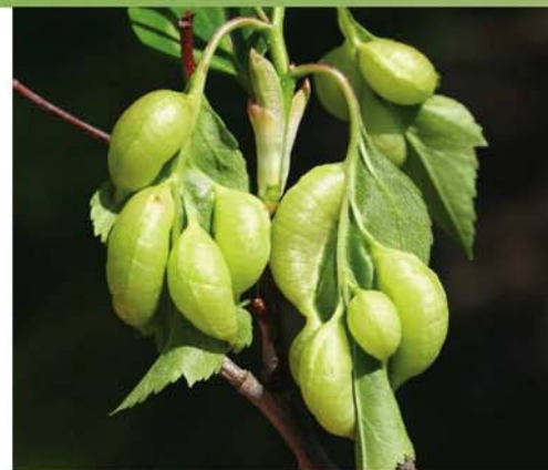
Hawthorn pod galls