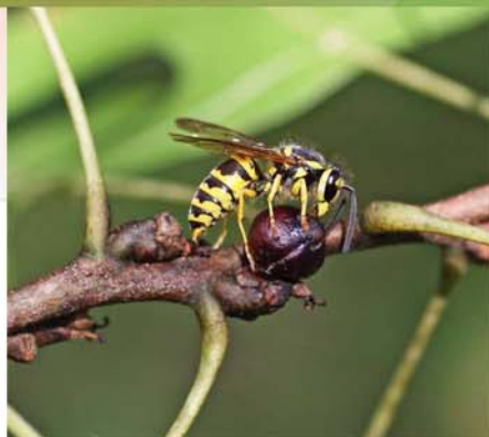
A yellowjacket is attracted to nectar produced by a bud gall.