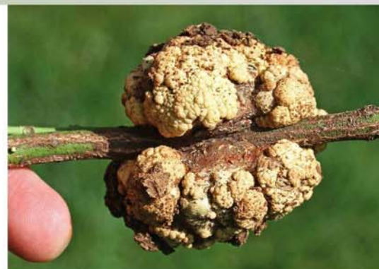
Although galls are sometimes incorrectly called "plant tumors," bacterial crown galls—such as this found on euonymus—resemble tumors because of their lack of organized structure.

cells may become phloem to the outside or xylem to the inside, which is how trees increase girth. However, if exposed to oxygen, the cambial cells form an entirely different type of tissue called callus tissue. This tissue overgrows wounds through the bark. It is the tree's method for closing a wound; trees do not heal, they seal.