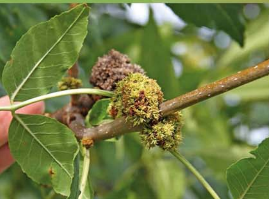
Ash flower gall