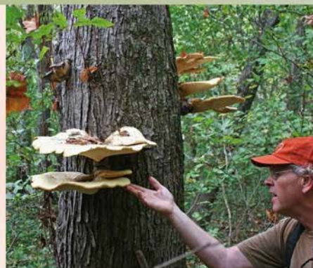
These shelflike structures are not galls, but dryad saddle bracket fungi ( Polyporus squamosus ).