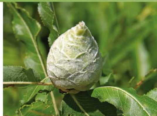
Scales that envelop this gall resemble a pinecone—thus the name willow pinecone gall.