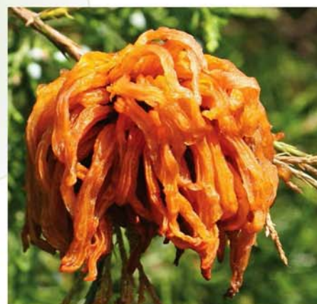
Figure 6. This cedar-apple rust fungal gall exhibits telltale bright orange, gelatinous, tentacle-like telial horns.

Although black knot is primarily associated with cherry and plums, fungal galls have been recorded on 24 species of Prunus . Young galls are olive-green or reddish-green and have a velvety texture; older galls are coal-black and corky. The galls may develop a white or pink discoloration caused by the fungal parasite, Trichothecium roseum .