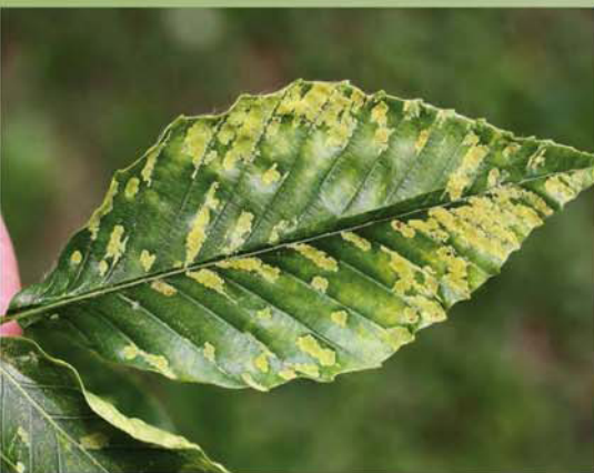
Erineum galls on beech