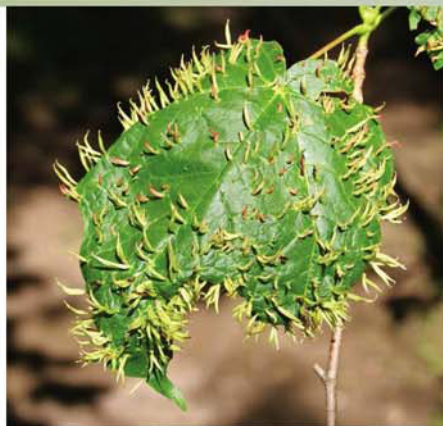
Maple spindle galls