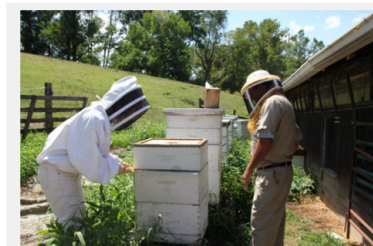
Beekeepers tending hives.