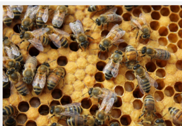
Adult bees feeding bee larvae.