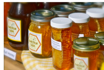
Local honey supports local beekeepers.

Sunflower, borage and butterfly weed: a few honey bee favorites in summer.