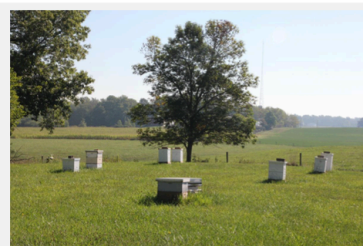
An apiary, also called a "bee yard."

Honey bees are social bees that live together in a colony made up of one queen, thousands of female worker bees and male drones. As many as 50,000 to 90,000 bees can live together in one colony at the height of the season.