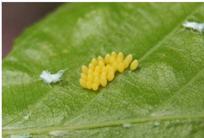
Figure 2. Multicolored Asian lady beetle eggs.

The immature (larva) (Figure 3) that hatches from the egg looks nothing like the adult beetle. MALB larvae are covered with tiny, flexible spines (non-stinging). Their body is elongate, somewhat flattened, and "alligator-