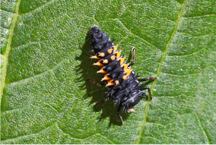
Figure 3. Multicolored Asian lady beetle larva.

The larva eventually molts into a pupa (Figure 4), which is about the same size as the adult beetle and resembles an orangish-red pill firmly attached to plants, often on the underside of leaves. The pupae have distinct segments and two parallel, longitudinal rows of black spots. MALB spends around 5 to 6 days in the pupal stage.