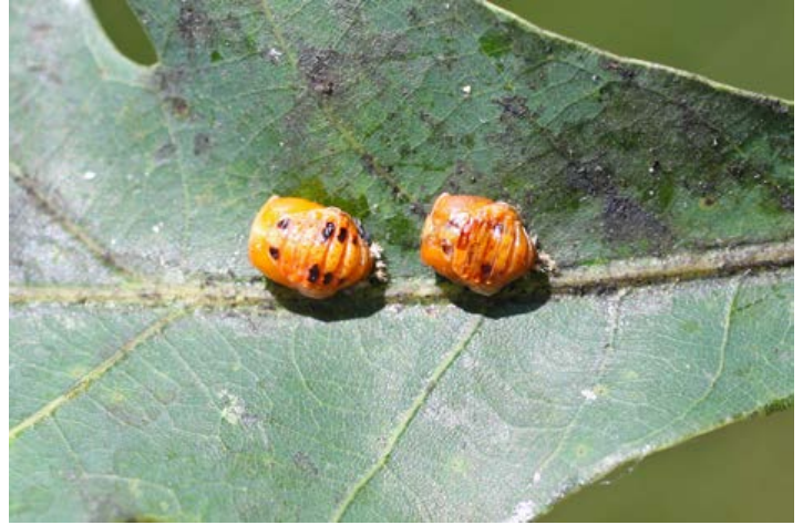
Figure 4. Multicolored Asian lady beetle pupae.