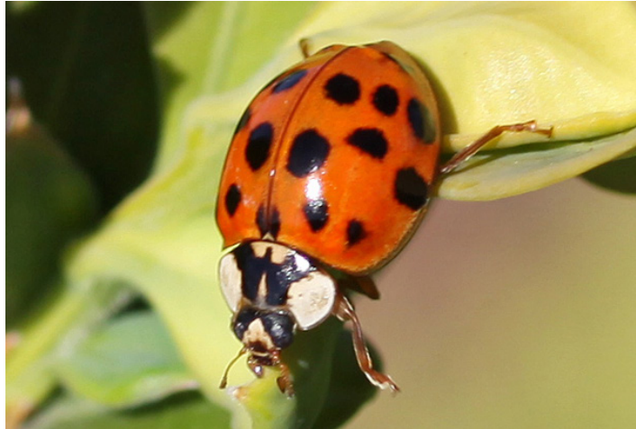
Figure 1. Multicolored Asian lady beetle adult.

The multicolored Asian lady beetle (MALB) (Figure 1) is native to Asia, where it is an important predator that feeds on aphids and other soft-bodied insects that dwell in trees. Exactly how MALB made its way to North America remains shrouded in controversy. There are several reports that this species was accidentally brought on ships to various ports, notably New Orleans and Seattle. However, it is well documented that MALB was also intentionally imported from Russia, Japan, Korea, and elsewhere in the Orient and released in a number of U.S. states and Nova Scotia, Canada, as part of USDA biological control programs to manage insect pests of trees. The rationale was that native species of lady beetles are not particularly effective in controlling tree-feeding aphids and scale insects. MALB release programs were eventually halted based on consistent failures to recapture beetles, which suggested that MALB was not surviving in the United States.